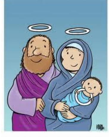
THE BABY JESUS STARTS TEETHING.